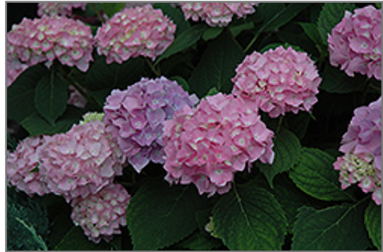
Endless Summer The Original Hydrangea flowers

Endless Summer The Original Hydrangea is a multi-stemmed deciduous shrub with a more or less rounded form. Its relatively coarse texture can be used to stand it apart from other landscape plants with finer foliage.