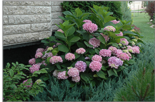
Endless Summer The Original Hydrangea in bloom

Endless Summer The Original Hydrangea makes a fine choice for the outdoor landscape, but it is also well-suited for use in outdoor pots and containers. Because of its height, it is often used as a 'thriller' in the 'spiller-thriller-filler' container combination; plant it near the center of the pot, surrounded by smaller plants and those that spill over the edges. It is even sizeable enough that it can be grown alone in a suitable container. Note that when grown in a container, it may not perform exactly as indicated on the tag - this is to be expected. Also note that when growing plants in outdoor containers and baskets, they may require more frequent waterings than they would in the yard or garden. Be aware that in our climate, most plants cannot be expected to survive the winter if left in containers outdoors, and this plant is no exception. Contact our experts for more information on how to protect it over the winter months.