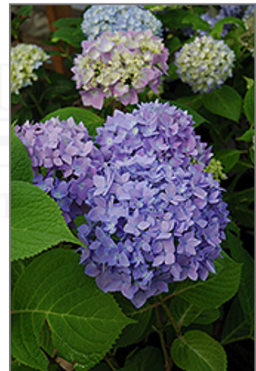
Endless Summer The Original Hydrangea flowers