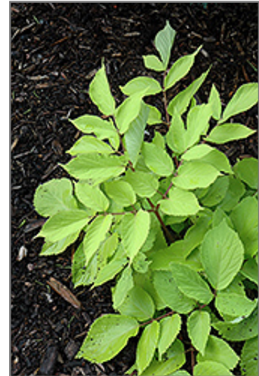
Sun King Japanese Spikenard foliage

This plant performs well in both full sun and full shade. It prefers to grow in average to moist conditions, and shouldn't be allowed to dry out. It is not particular as to soil type or pH. It is highly tolerant of urban pollution and will even thrive in inner city environments. This is a selected variety of a species not originally from North America.