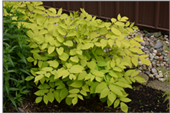
Sun King Japanese Spikenard

Sun King Japanese Spikenard is an herbaceous perennial with a ground-hugging habit of growth. Its wonderfully bold, coarse texture can be very effective in a balanced garden composition.