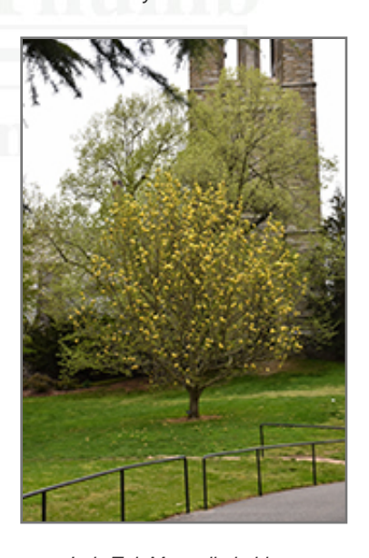
Judy Zuk Magnolia in bloom