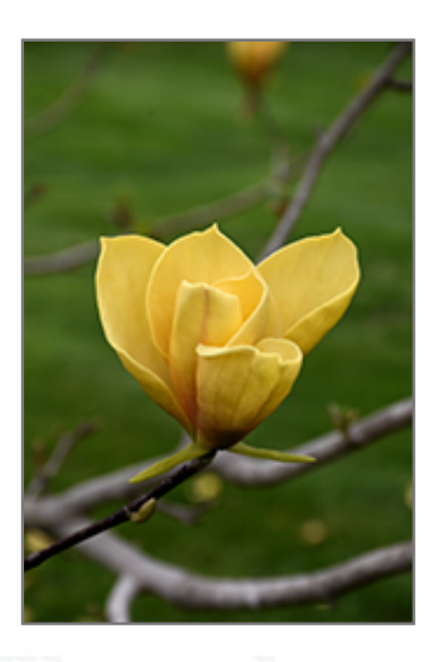
Judy Zuk Magnolia flowers