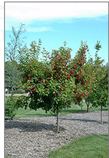
Ruby Slippers Amur Maple