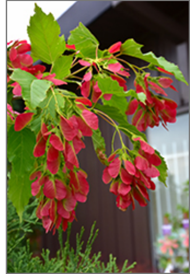
Ruby Slippers Amur Maple fruit