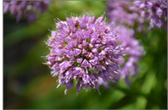
Millenium Ornamental Onion flowers