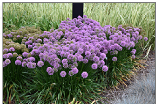
Millenium Ornamental Onion in bloom