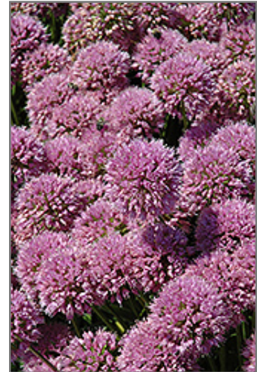
Millenium Ornamental Onion flowers

Millenium Ornamental Onion is an open herbaceous perennial with tall flower stalks held atop a low mound of foliage. Its relatively coarse texture can be used to stand it apart from other garden plants with finer foliage.