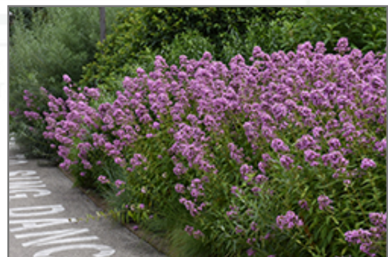
Jeana Garden Phlox in bloom