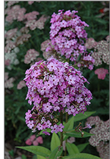
Jeana Garden Phlox flowers

Jeana Garden Phlox is a dense herbaceous perennial with an upright spreading habit of growth. Its medium texture blends into the garden, but can always be balanced by a couple of finer or coarser plants for an effective composition.