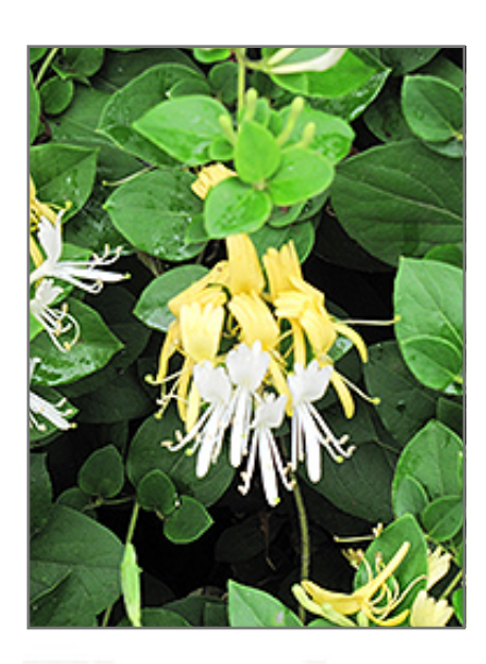
Hall's Japanese Honeysuckle flowers