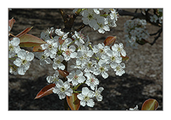
Chojuro Asian Pear flowers

Chojuro Asian Pear is clothed in stunning clusters of white flowers with pink anthers along the branches in early spring before the leaves. It has dark green deciduous foliage which emerges coppery-bronze in spring. The glossy pointy leaves turn an outstanding tomato-orange in the fall. The fruits are showy brown pears carried in abundance in late summer. The fruit can be messy if allowed to drop on the lawn or walkways, and may require occasional clean-up.