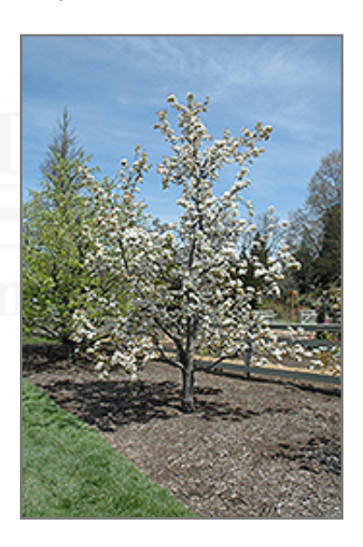
Chojuro Asian Pear in bloom