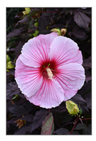
Starry Starry Night Hibiscus flowers

Starry Starry Night Hibiscus is an herbaceous perennial with an upright spreading habit of growth. Its relatively coarse texture can be used to stand it apart from other garden plants with finer foliage.