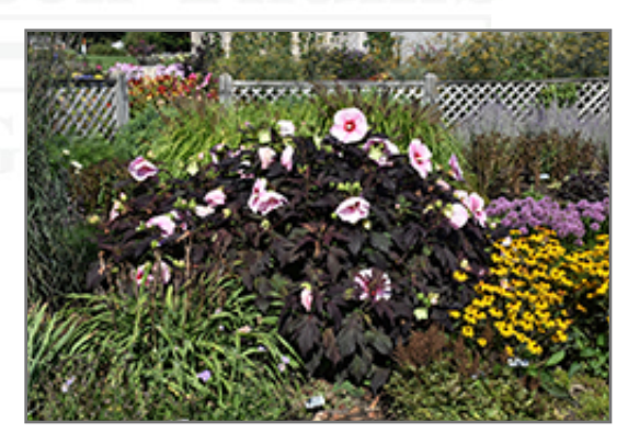
Starry Starry Night Hibiscus in bloom