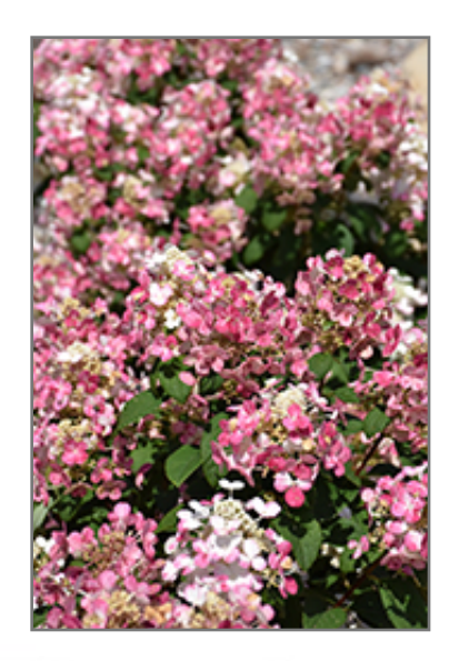
Little Quick Fire Hydrangea flowers

Little Quick Fire Hydrangea is recommended for the following landscape applications;