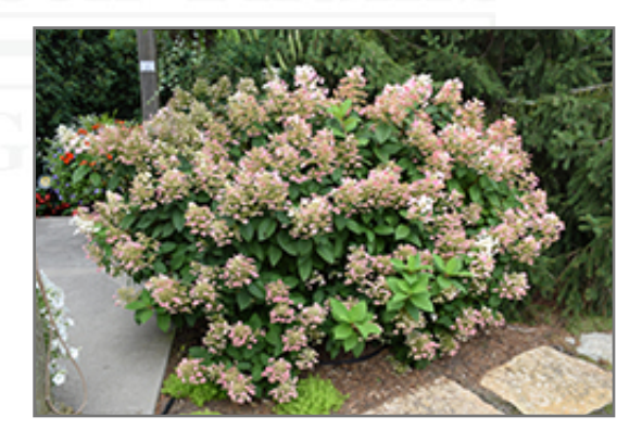
Little Quick Fire Hydrangea in bloom