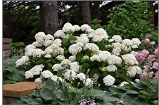
Annabelle Hydrangea in bloom