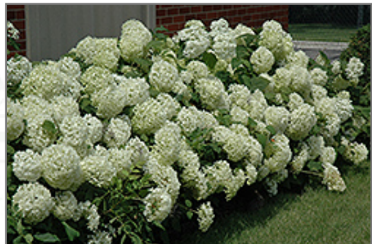
Annabelle Hydrangea in bloom