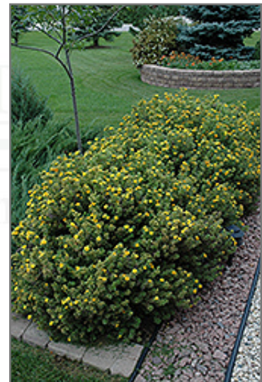
Mango Tango Potentilla in bloom