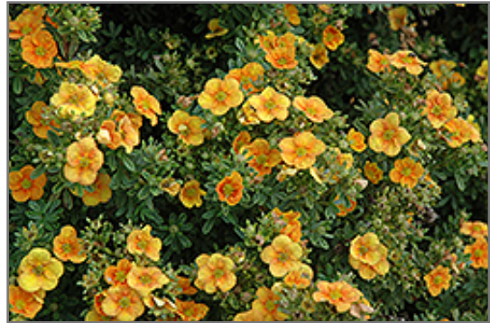
Mango Tango Potentilla flowers

Mango Tango Potentilla is a dense multi-stemmed deciduous shrub with a more or less rounded form. It lends an extremely fine and delicate texture to the landscape composition which should be used to full effect.