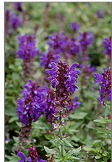
Blue Marvel Meadow Sage flowers