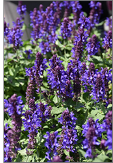
Blue Marvel Meadow Sage flowers

Blue Marvel Meadow Sage is recommended for the following landscape applications;