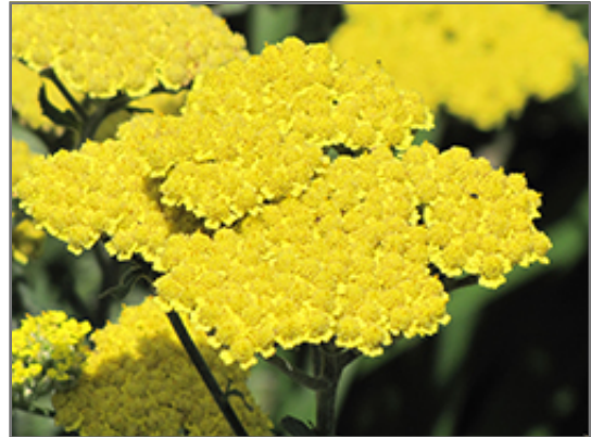
Moonshine Yarrow flowers