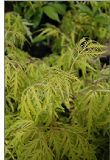
Lemony Lace Elder foliage

Lemony Lace Elder is recommended for the following landscape applications;