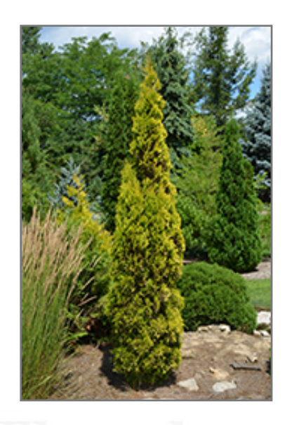
Amber Gold Arborvitae

Amber Gold Arborvitae is recommended for the following landscape applications;