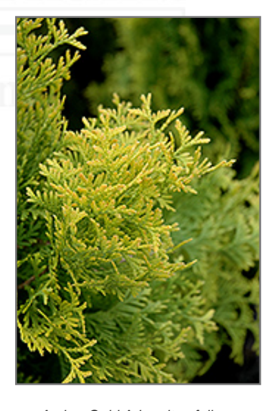
Amber Gold Arborvitae foliage