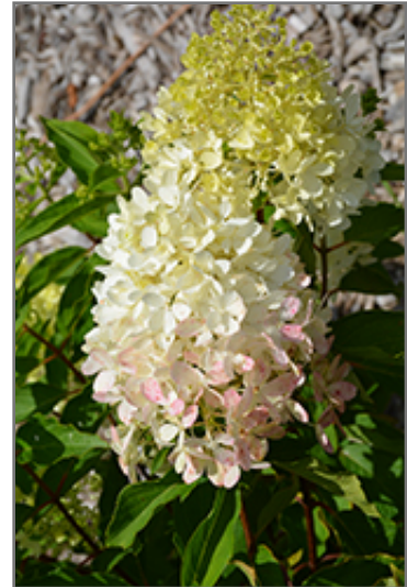
Zinfin Doll Hydrangea flowers

Zinfin Doll Hydrangea is recommended for the following landscape applications;