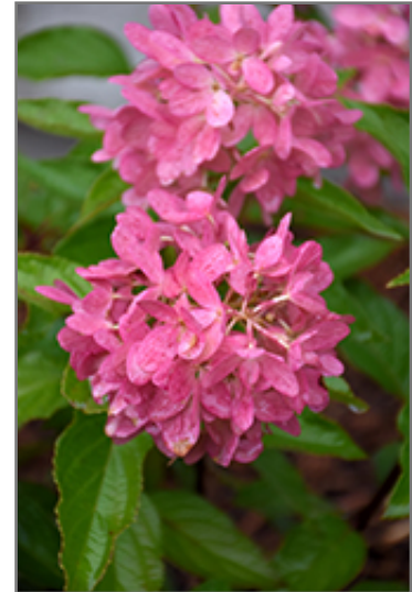
Zinfon Doll Hydrangea flowers (faded)

This shrub performs well in both full sun and full shade. It prefers to grow in average to moist conditions, and shouldn't be allowed to dry out. It is not particular as to soil type or pH. It is highly tolerant of urban pollution and will even thrive in inner city environments. Consider applying a thick mulch around the root zone in winter to protect it in exposed locations or colder microclimates. This is a selected variety of a species not originally from North America.