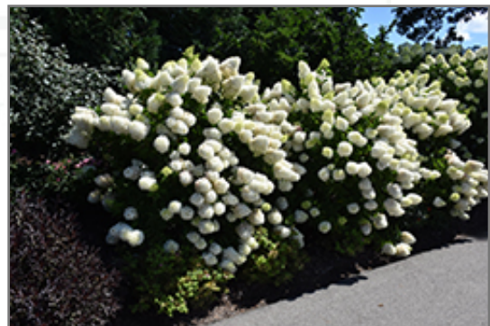
Zinfin Doll Hydrangea in bloom