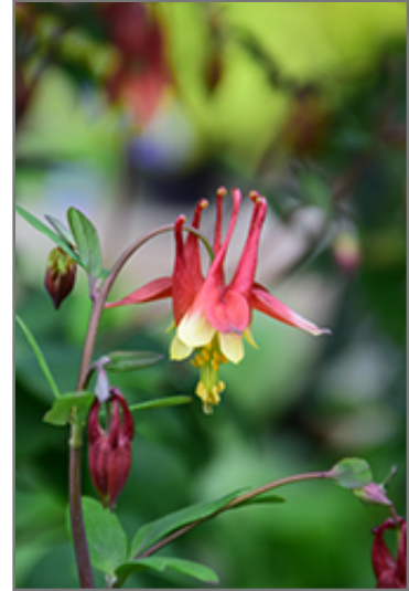
Wild Red Columbine flowers