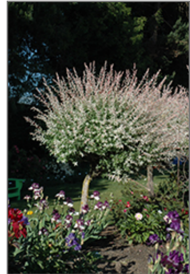
Tricolor Willow (tree form)

Tricolor Willow (tree form) is a fine choice for the yard, but it is also a good selection for planting in outdoor pots and containers. With its upright habit of growth, it is best suited for use as a 'thriller' in the 'spiller-thriller-filler' container combination; plant it near the center of the pot, surrounded by smaller plants and those that spill over the edges. It is even sizeable enough that it can be grown alone in a suitable container. Note that when grown in a container, it may not perform exactly as indicated on the tag - this is to be expected. Also note that when growing plants in outdoor containers and baskets, they may require more frequent waterings than they would in the yard or garden. Be aware that in our climate, most plants cannot be expected to survive the winter if left in containers outdoors, and this plant is no exception. Contact our experts for more information on how to protect it over the winter months.