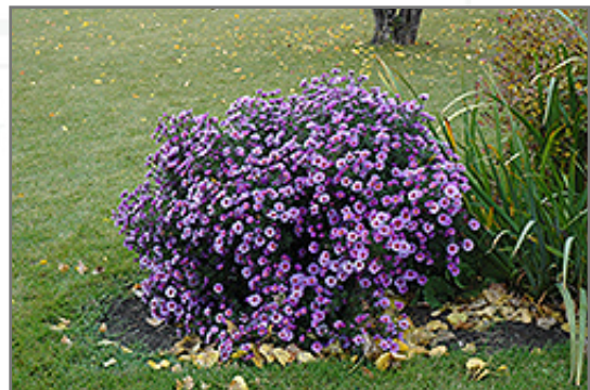
Purple Dome Aster in bloom