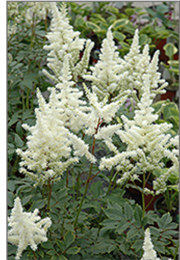
Bridal Veil Astilbe flowers

Bridal Veil Astilbe is an herbaceous perennial with an upright spreading habit of growth. Its relatively fine texture sets it apart from other garden plants with less refined foliage.