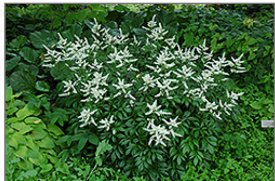
Bridal Veil Astilbe in bloom