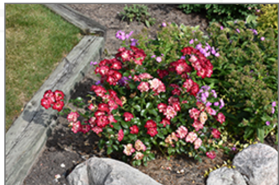
Never Alone Rose in bloom