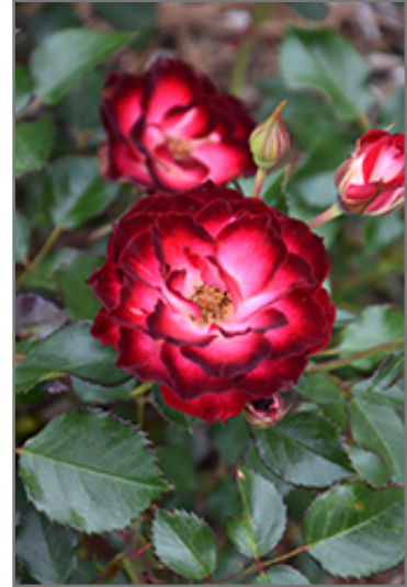
Never Alone Rose flowers

Never Alone Rose is a multi-stemmed deciduous shrub with an upright spreading habit of growth. Its average texture blends into the landscape, but can be balanced by one or two finer or coarser trees or shrubs for an effective composition.