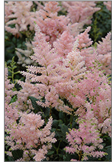
Peach Blossom Astilbe flowers

Peach Blossom Astilbe is an herbaceous perennial with an upright spreading habit of growth. Its relatively fine texture sets it apart from other garden plants with less refined foliage.