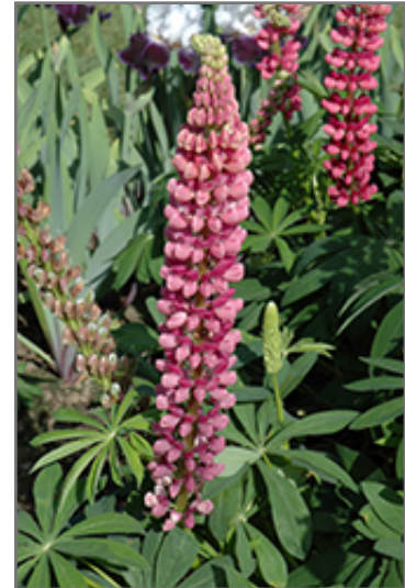
Popsicle Pink Lupine flowers

A standout dwarf hybrid producing thick spikes of eye catching pink flowers; a tremendous visual impact when massed in the garden, in border plantings or containers