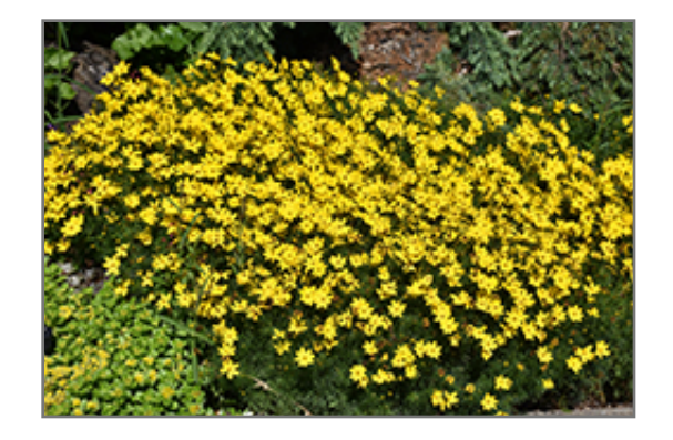
Zagreb Tickseed in bloom

Zagreb Tickseed is an open herbaceous perennial with a mounded form. It brings an extremely fine and delicate texture to the garden composition and should be used to full effect.