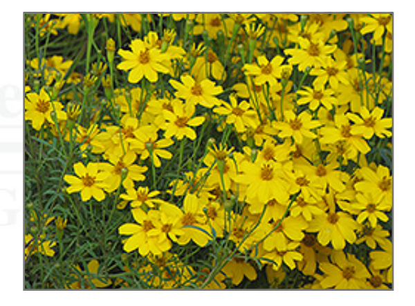
Zagreb Tickseed flowers

This is a relatively low maintenance plant, and is best cleaned up in early spring before it resumes active growth for the season. It is a good choice for attracting butterflies to your yard, but is not particularly attractive to deer who tend to leave it alone in favor of tastier treats. It has no significant negative characteristics.