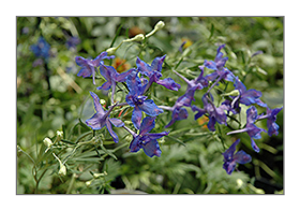
Blue Butterfly Delphinium flowers