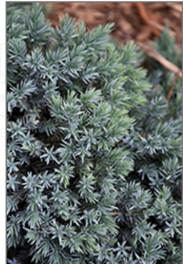
Blue Star Juniper foliage