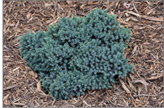
Blue Star Juniper

Blue Star Juniper is recommended for the following landscape applications;