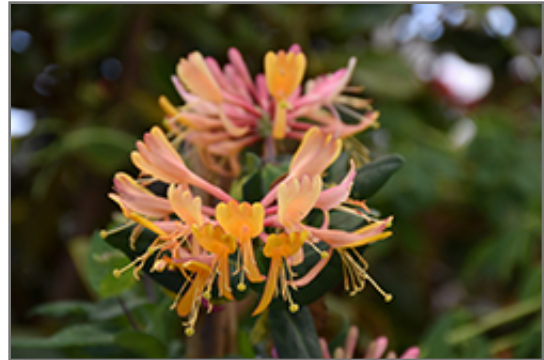
Goldflame Honeysuckle flowers

Goldflame Honeysuckle is recommended for the following landscape applications;