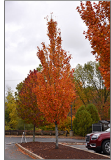
Armstrong Gold Maple in fall

This tree should only be grown in full sunlight. It is quite adaptable, preferring to grow in average to wet conditions, and will even tolerate some standing water. It is not particular as to soil type or pH. It is highly tolerant of urban pollution and will even thrive in inner city environments. This particular variety is an interspecific hybrid.