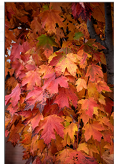
Armstrong Gold Maple in fall