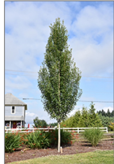
Armstrong Gold Maple

Armstrong Gold Maple is recommended for the following landscape applications;