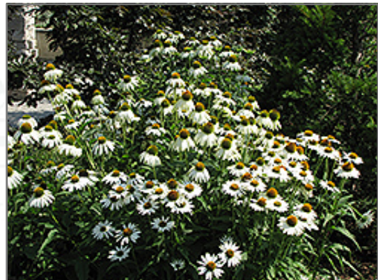
White Swan Coneflower in bloom