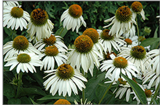
White Swan Coneflower flowers

This is a relatively low maintenance plant, and is best cleaned up in early spring before it resumes active growth for the season. It is a good choice for attracting butterflies to your yard, but is not particularly attractive to deer who tend to leave it alone in favor of tastier treats. It has no significant negative characteristics.