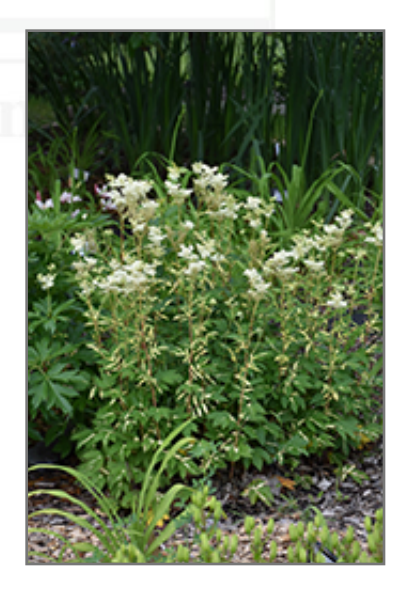
Variegated Queen Of The Meadow in bloom