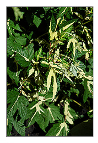
Variegated Queen Of The Meadow foliage

This plant does best in partial shade to shade. It is quite adaptable, prefering to grow in average to wet conditions, and will even tolerate some standing water. It is not particular as to soil pH, but grows best in rich soils. It is somewhat tolerant of urban pollution. Consider applying a thick mulch around the root zone over the growing season to conserve soil moisture. This is a selected variety of a species not originally from North America. It can be propagated by division; however, as a cultivated variety, be aware that it may be subject to certain restrictions or prohibitions on propagation.