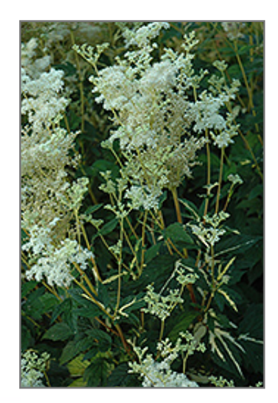
Variegated Queen Of The Meadow flowers

Variegated Queen Of The Meadow is recommended for the following landscape applications;