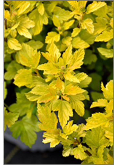
Tiny Wine Gold Ninebark foliage

This is a relatively low maintenance shrub, and can be pruned at anytime. It has no significant negative characteristics.