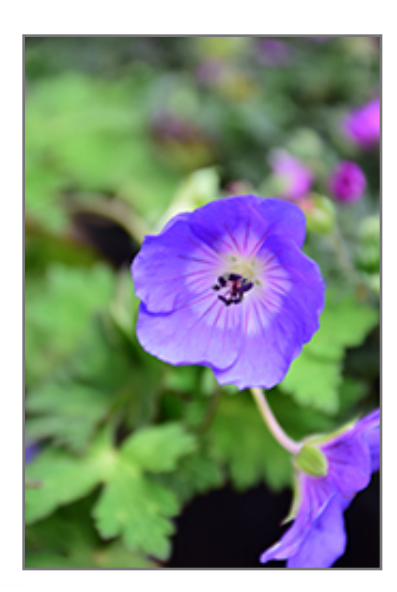
Rozanne Cranesbill flowers

Rozanne Cranesbill is an herbaceous perennial with a mounded form. Its relatively fine texture sets it apart from other garden plants with less refined foliage.