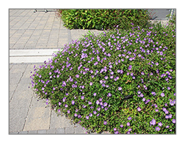
Rozanne Cranesbill in bloom

Rozanne Cranesbill will grow to be about 18 inches tall at maturity, with a spread of 24 inches. When grown in masses or used as a bedding plant, individual plants should be spaced approximately 20 inches apart. Its foliage tends to remain dense right to the ground, not requiring facer plants in front. It grows at a medium rate, and under ideal conditions can be expected to live for approximately 10 years. As an herbaceous perennial, this plant will usually die back to the crown each winter, and will regrow from the base each spring. Be careful not to disturb the crown in late winter when it may not be readily seen!