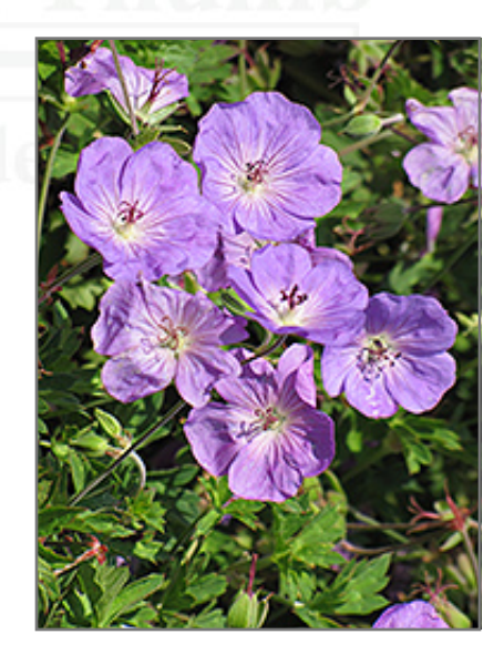
Rozanne Cranesbill flowers