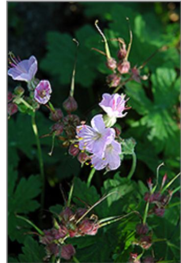
Ingerwesen's Variety Cranesbill flowers

Ingerwesen's Variety Cranesbill is recommended for the following landscape applications;