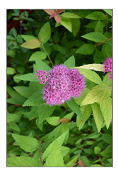
Double Play Candy Corn Spirea flowers

This shrub should only be grown in full sunlight. It prefers to grow in average to moist conditions, and shouldn't be allowed to dry out. It is not particular as to soil type or pH. It is highly tolerant of urban pollution and will even thrive in inner city environments. This is a selected variety of a species not originally from North America.