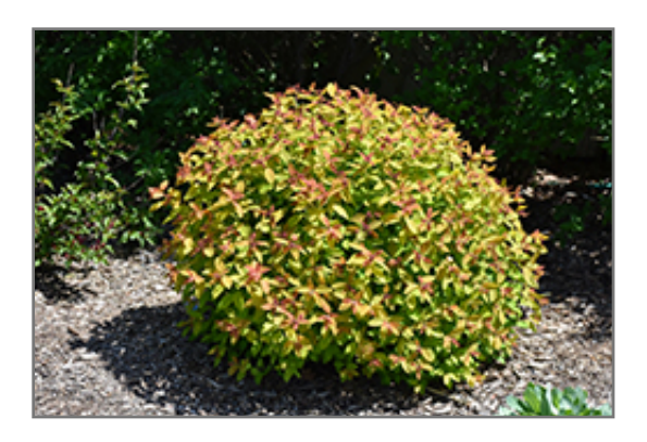
Double Play Candy Corn Spirea

This shrub will require occasional maintenance and upkeep, and is best pruned in late winter once the threat of extreme cold has passed. It is a good choice for attracting butterflies to your yard, but is not particularly attractive to deer who tend to leave it alone in favor of tastier treats. It has no significant negative characteristics.