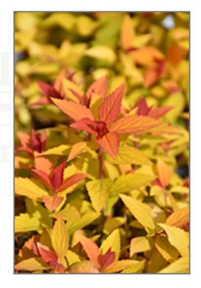
Double Play Candy Corn Spirea foliage