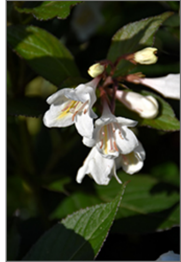
Tuxedo Weigela flowers

Tuxedo Weigela makes a fine choice for the outdoor landscape, but it is also well-suited for use in outdoor pots and containers. Because of its height, it is often used as a 'thriller' in the 'spiller-thriller-filler' container combination; plant it near the center of the pot, surrounded by smaller plants and those that spill over the edges. It is even sizeable enough that it can be grown alone in a suitable container. Note that when grown in a container, it may not perform exactly as indicated on the tag - this is to be expected. Also note that when growing plants in outdoor containers and baskets, they may require more frequent waterings than they would in the yard or garden. Be aware that in our climate, most plants cannot be expected to survive the winter if left in containers outdoors, and this plant is no exception. Contact our experts for more information on how to protect it over the winter months.