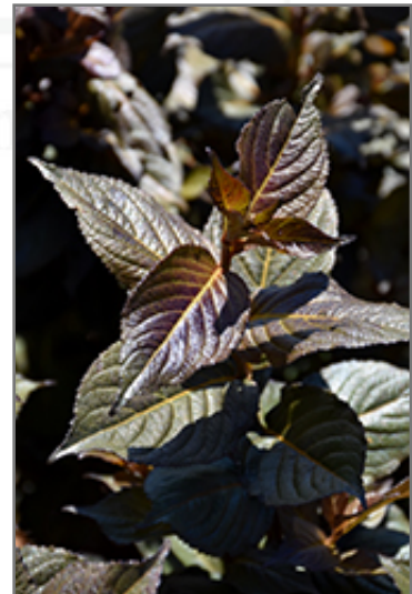
Tuxedo Weigela foliage