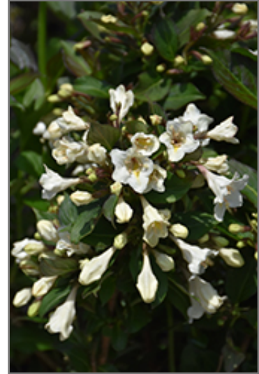
Tuxedo Weigela flowers

Tuxedo Weigela is recommended for the following landscape applications;