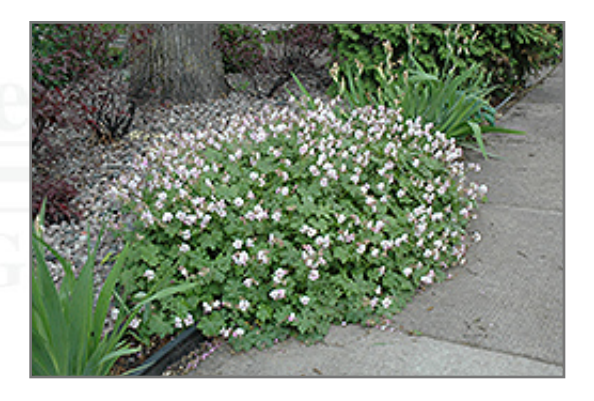
Biokovo Cranesbill in bloom