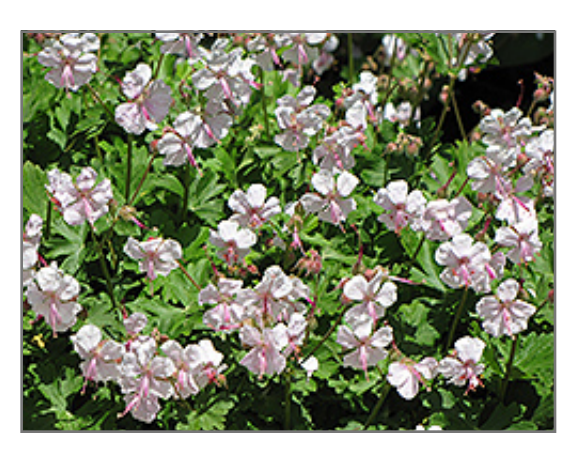
Biokovo Cranesbill in bloom

This plant will require occasional maintenance and upkeep, and should be cut back in late fall in preparation for winter. Deer don't particularly care for this plant and will usually leave it alone in favor of tastier treats. Gardeners should be aware of the following characteristic(s) that may warrant special consideration;