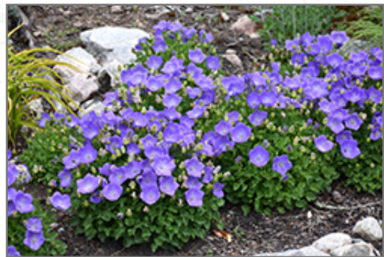
Rapido Blue Bellflower in bloom