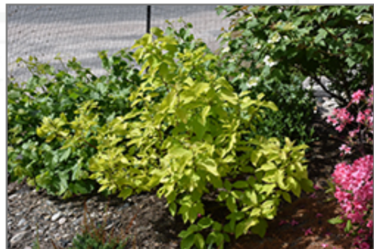
Neon Burst Dogwood