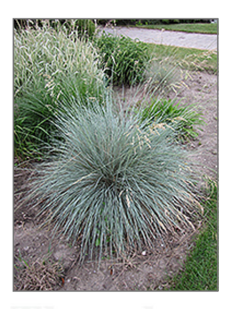
Blue Oat Grass in bloom