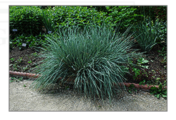
Blue Oat Grass