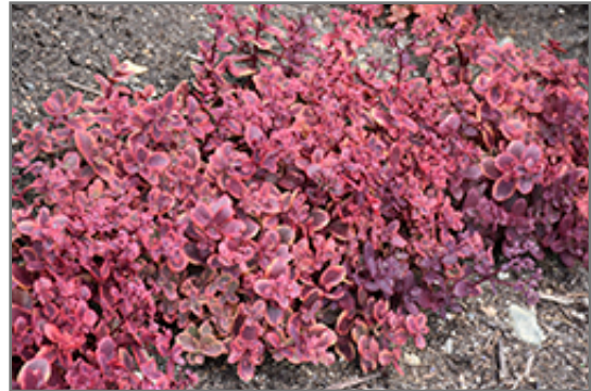
Sunsparkler Wildfire Stonecrop