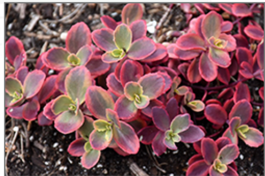
Sunsparkler Wildfire Stonecrop foliage