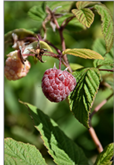
Royalty Raspberry fruit

Royalty Raspberry has rich green deciduous foliage on a plant with an upright spreading habit of growth. The fuzzy oval compound leaves do not develop any appreciable fall colour. It features an abundance of magnificent burgundy berries in mid summer, which fade to deep purple over time.