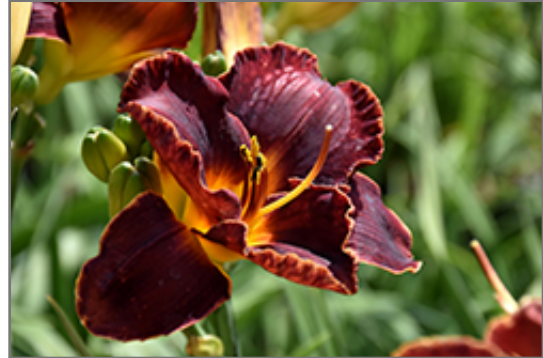
Night Embers Daylily flowers