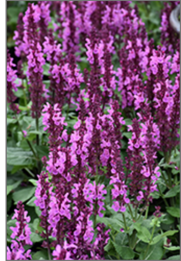
Rose Marvel Meadow Sage flowers

Rose Marvel Meadow Sage is an herbaceous perennial with an upright spreading habit of growth. Its relatively fine texture sets it apart from other garden plants with less refined foliage.