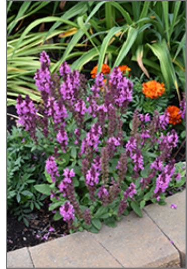
Rose Marvel Meadow Sage in bloom

Rose Marvel Meadow Sage will grow to be about 10 inches tall at maturity extending to 14 inches tall with the flowers, with a spread of 12 inches. When grown in masses or used as a bedding plant, individual plants should be spaced approximately 10 inches apart. It grows at a medium rate, and under ideal conditions can be expected to live for approximately 5 years. As an herbaceous perennial, this plant will usually die back to the crown each winter, and will regrow from the base each spring. Be careful not to disturb the crown in late winter when it may not be readily seen!