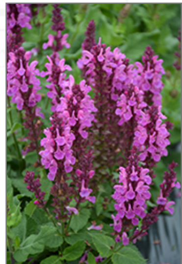
Rose Marvel Meadow Sage flowers