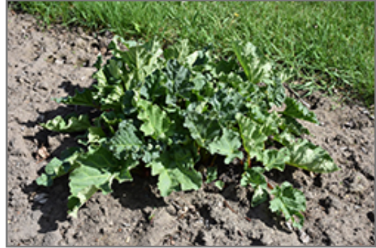
Victoria Rhubarb