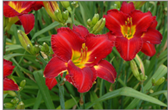
Chicago Apache Daylily flowers