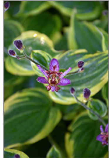
Autumn Glow Toad Lily flowers

Autumn Glow Toad Lily is an open herbaceous perennial with an upright spreading habit of growth. Its relatively fine texture sets it apart from other garden plants with less refined foliage.