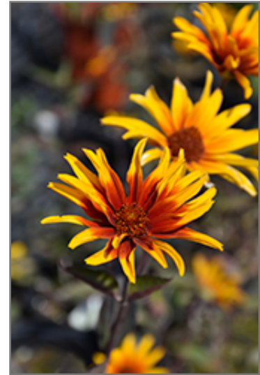
Burning Hearts False Sunflower flowers

Burning Hearts False Sunflower has masses of beautiful gold daisy flowers with coppery-bronze eyes and a tomato-orange ring at the ends of the stems from early summer to mid fall, which are most effective when planted in groupings. The flowers are excellent for cutting. Its serrated oval leaves emerge green in spring, turning dark green in colour with showy deep purple variegation throughout the season. The deep purple stems can be quite attractive.