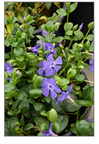
Bowles Cunningham Periwinkle flowers

One of the very best groundcovers for deep shade, featuring showy sky blue flowers held over lustrous dark green evergreen foliage; does well in sun or deep shade, quickly forms a dense mat, even grows well under mature trees