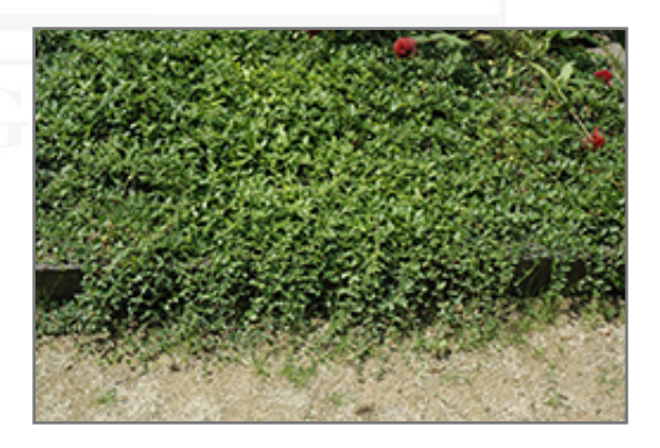
Bowles Cunningham Periwinkle

Bowles Cunningham Periwinkle is an herbaceous evergreen perennial with a ground-hugging habit of growth. Its medium texture blends into the garden, but can always be balanced by a couple of finer or coarser plants for an effective composition.