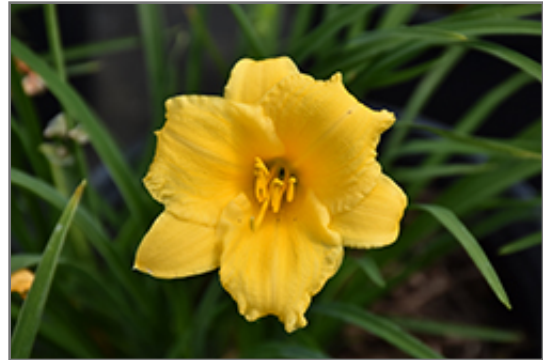
Stella de Oro Daylily flowers

Stella de Oro Daylily is recommended for the following landscape applications;