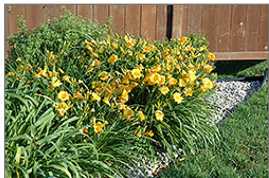
Stella de Oro Daylily in bloom